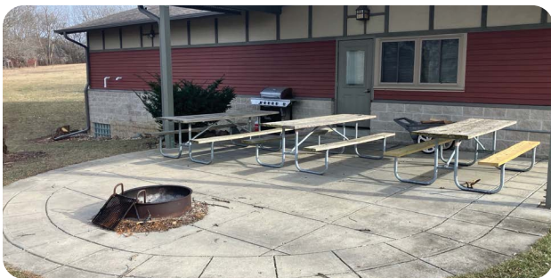
Picnic Area at Troop House

*Only available during the summer or by exception