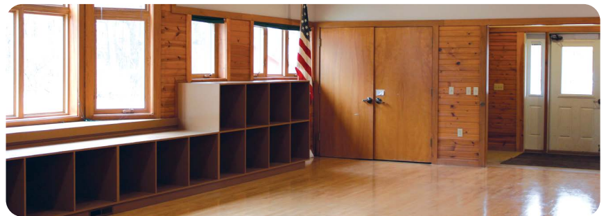
Inside Troop House