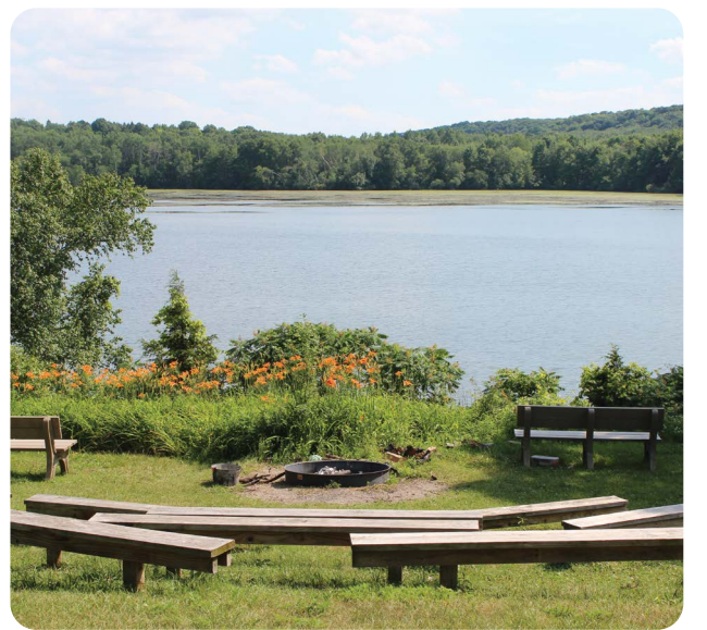
All Camp Fire Scar overlooking Lucas Lake