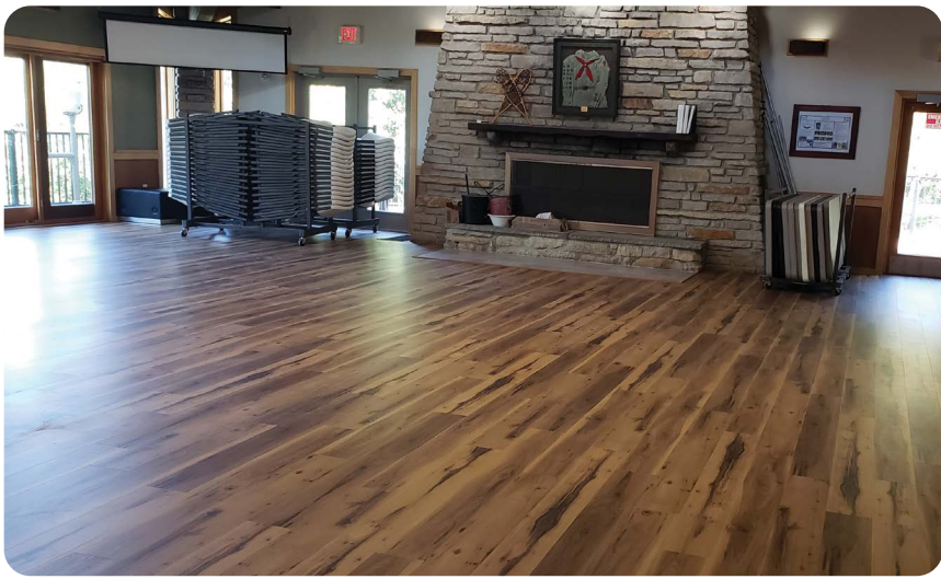
Jo Ann Mann Lodge, Upper Level