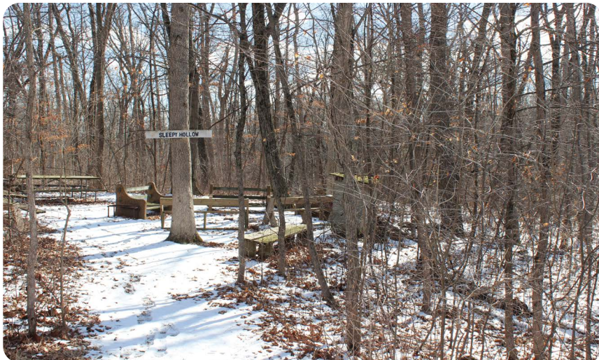
Sleepy Hollow Fire Scar