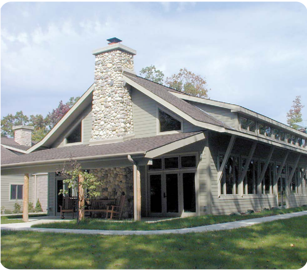
Trefoil Oaks Program Center