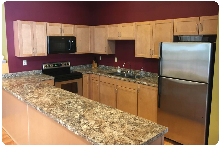
Bunk Room Kitchen