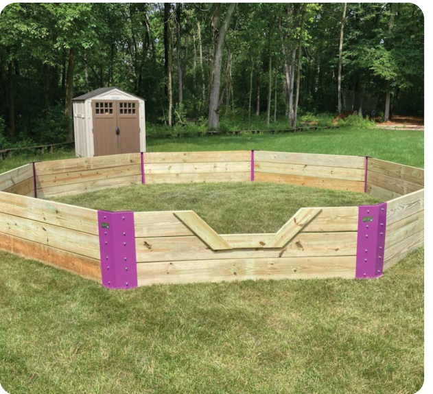
Gaga Ball Pit