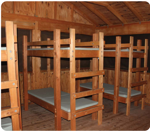
Maple Ridge Cabins